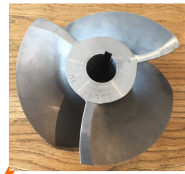
3. Rear Impellor