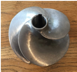
1. Front Impellor